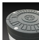
RAL painted cover