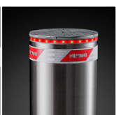
LED lighting strip