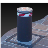
Frame for paving stones