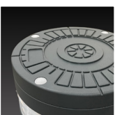
RAL painted cover