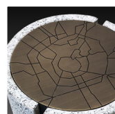
Custom cover plate